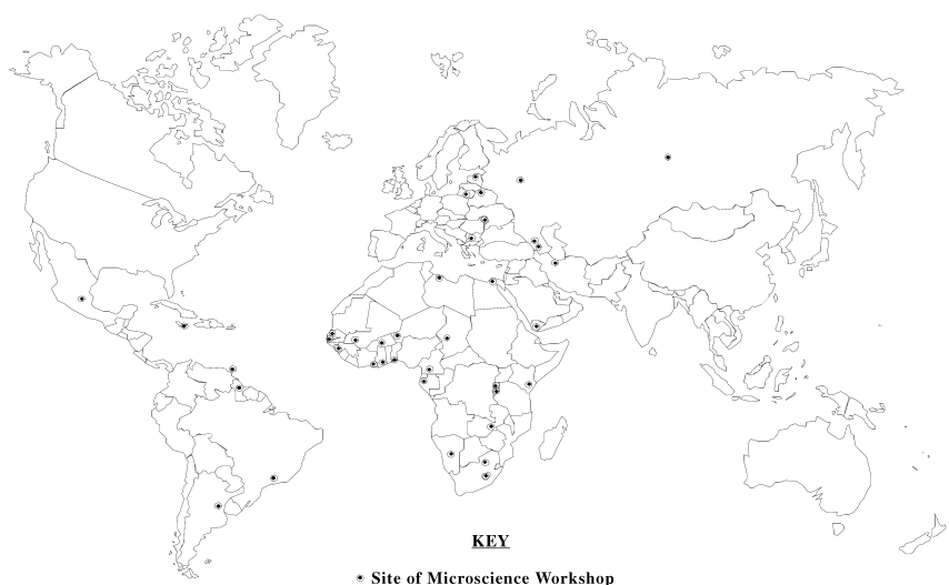
Fig. 1 UNESCO/IUPAC–CTC Global Program.

The cooperation between UNESCO (Basic Sciences Division) and IUPAC–CTC in this program has been very fruitful. Introductory workshops have been held in nearly 40 countries, and these have led to pilot projects in nearly half of these.